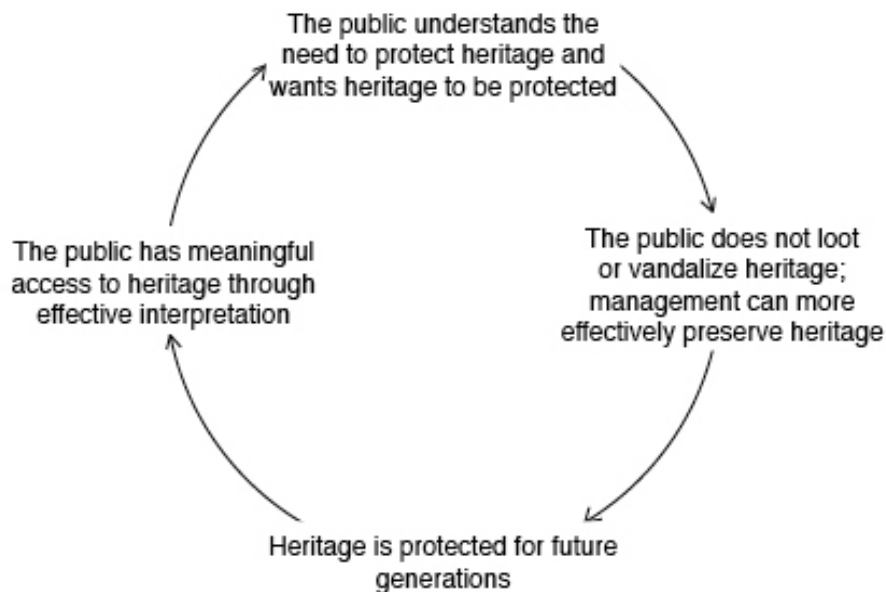
Figure 2: Feedback Loop of Access and Preservation

Woven throughout the international, national, and state laws and policies on underwater heritage are the competing management imperatives of preserving submerged cultural resources while simultaneously providing public access to them. To meet this challenge, heritage management legislation and policy emphasizes the potential power of public access and preservation goals to complement each other and create a feedback loop (Figure 2, below):